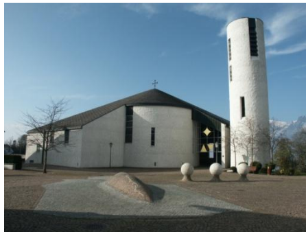
New Parish Church of the Immaculate Heart of Mary

A first church was built in Mittelschellenberg in 1855/56. The cloister of the Sisters of the Precious Blood was established in 1858 in connection with the efforts to create a separate parish. The first cloister building was attached directly to the church. The order now has 40 nuns.