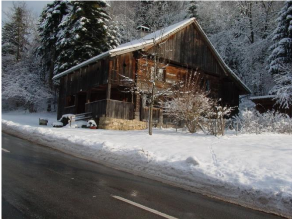
Biedermann House Rural Museum

Near the Town Hall stands the Biedermann House . This farmhouse, made of wood in the typical local fashion, was built in the 16th century. It was moved here from its original location on the Platta in 1992/93.