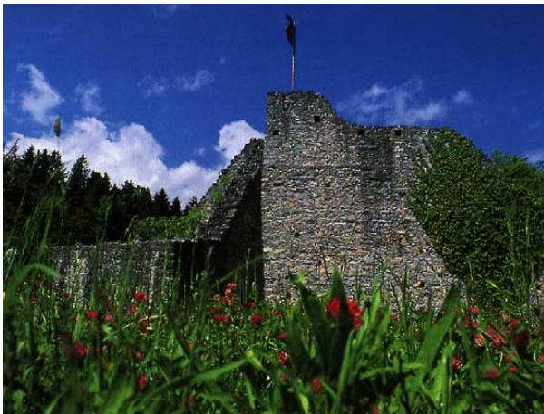
Ruin of the Upper Fortress in Hinterschloss

The name Schellenberg is of more recent origin. It comes from the fortresses whose ruins lie on the territory of the municipality. The fortresses were built by the Lords of Schellenberg. This noble line originally resided in the Bad Tölz area in Upper Bavaria and came to the Alpine Rhine Valley through the Staufer line. The Lords of Schellenberg are repeatedly mentioned in our area in documents after 1200, but already in 1317/18, they sold their shares of the Eschnerberg to the Counts of Werdenberg-Heiligenberg of Bludenz. Like the Counts of Montfort of Feldkirch and the Counts of Werdenberg-Sargans-Vaduz, they had also owned parts of the Eschnerberg for generations. Various Schellenberger lines developed in different parts of Southwestern Germany after their departure from our region. The modern coat of arms of the Municipality of Schellenberg derives from the knightly coat of arms of the Schellenberger.