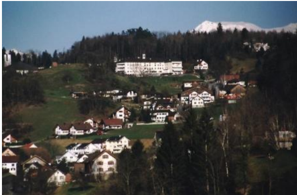
Schellenberg as seen from Gamprin

At 355 hectares (877 acres), Schellenberg is the smallest municipality by area in the Principality of Liechtenstein. The elevation of the municipal territory ranges from 430 meters (1411 feet) on the valley floor to 698 meters (2290 feet) at the highest point on the Gantenstein.