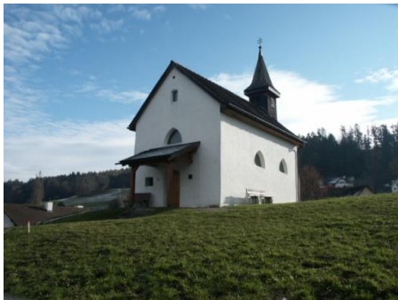
St. George's Chapel in Hinterschellenberg

In Hinterschellenberg stands a chapel dedicated to St. George . It was built presumably around 1700 and has existed in its current form since 1850/55.